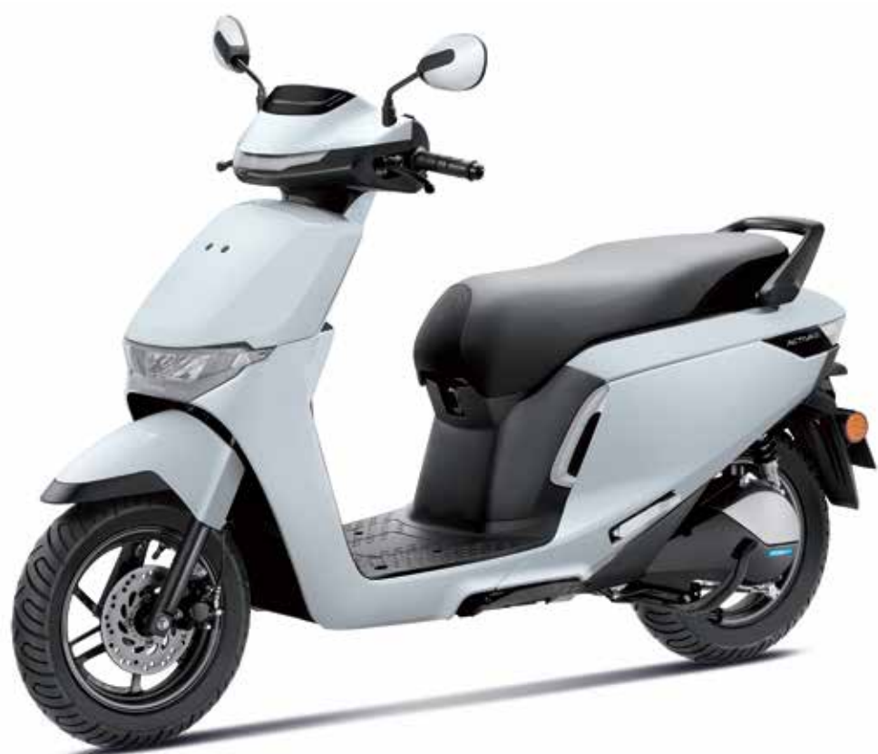
Pearl Misty White

*Products shown in the pictures may vary from actual products available in the market. All features and colours may not be part of all variants. Accessories shown in the pictures are not part of standard equipment. For creative visualisation only.